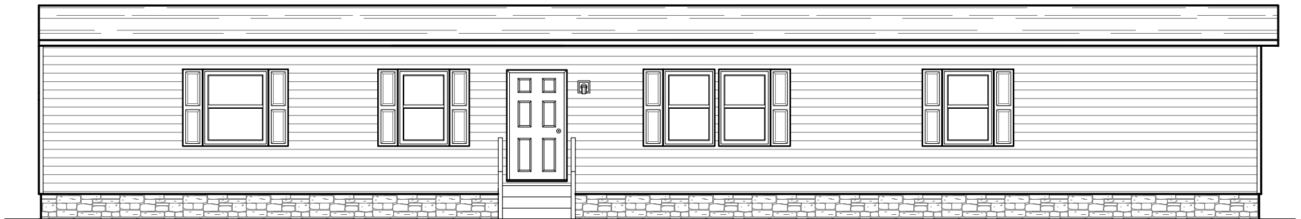
FRONT SIDE ELEVATION

1104 SQ.FT. (STD PLAN "CONDITIONED") N/A SQ.FT. (W/OPT. PORCH/RECESS "CONDITIONED")