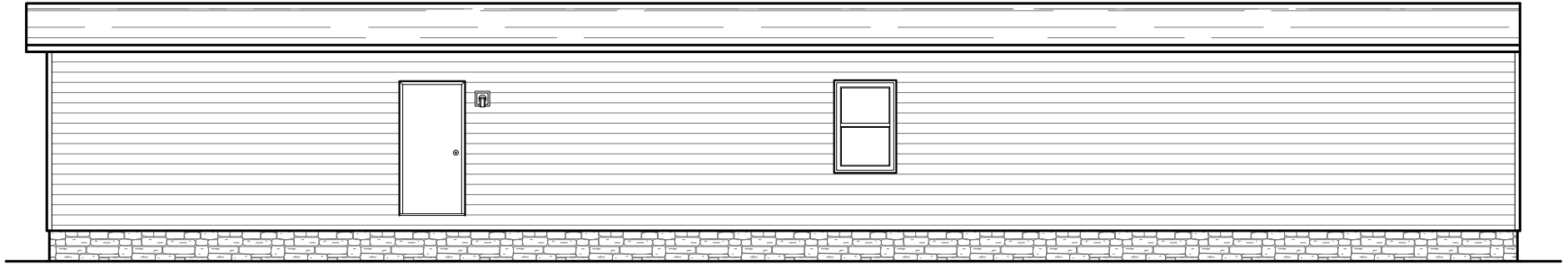
REAR SIDE ELEVATION